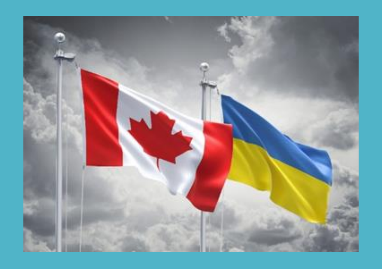
SHUSWAP SUPPORT TO UKRAINIANS 6 July 2022